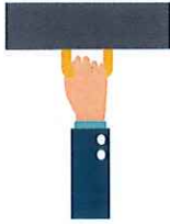
Internal handles above doors